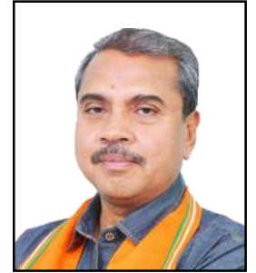
Dr. Munjpara Mahendrabhai Kalubhai Hon'ble Union Minister of State Ministry of Ayush & Ministry of Women & Child Development

The Hon'ble Union Minister of Ayush & Ports, Shipping and Waterways, Govt. of India is the President of the General Body of the Institute. The Secretary, Ministry of Ayush, Govt. of India is the Chairman of the Governing Council. The Director of the Institute is the Chief Executive Officer and “Head of the Department” of the Institute and exercises the power of “Head of the Department” and inter-alia, discharges the duties as mentioned in the MoA and bye-laws of the Institute.