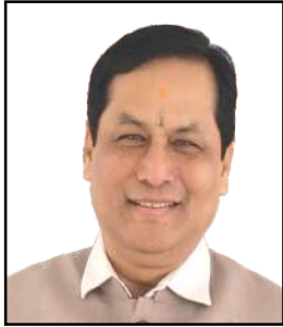
Shri Sarbananda Sonowal Hon'ble Union Minister of Ayush & Ports, Shipping and Waterways, Govt. of India President GB

The Institute is fully funded by Ministry of Ayush, Govt. of India. The authorities and the officers of the Institute are - The President, The General Body, The Governing Council, The Director and such other committees, sub-committees, authorities and officers as may be appointed by the Governing Council, e.g. Standing Finance Committee, Scientific Advisory Committee, Academic Committee etc.