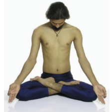
Jalandhar Bandh or Chin Lock

Pressing the chin against the sternum is known as Jalandhar Bandha