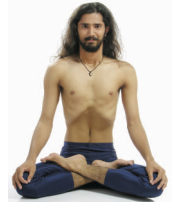
Uddiyana Bandh or Abdominal Lock

Exhaling out air and contracting the abdominal muscles is known as Uddiyana Bandha.