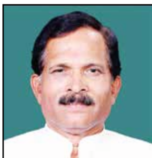
Shri Shripad Yesso Naik Hon'ble Minister of State (I/C) Ministry of AYUSH, Govt. of India President GB

The Institute is fully funded by Ministry of AYUSH, Govt. of India. The authorities and the officers of the Institute are - The President, The General Body, The Governing Council, The Director and such other committees, sub-committees, authorities and officers as may be appointed by the Governing Council, e.g. Standing Finance Committee, Scientific Advisory Committee, Academic Committee etc.